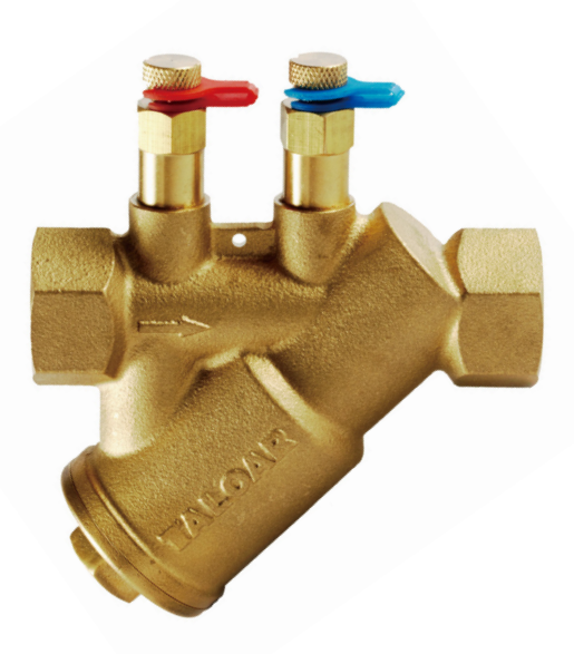
T320 <sup>1</sup>/<sub>2</sub>" - 1<sup>1</sup>/<sub>2</sub>"