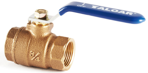
B109 1/2" - 2"

Full-Bore, Chrome-Plated Ball BSEN12288, Threaded Ends Comply to BS21 or ANSI 2.1