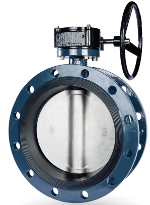
HB970-G/O 14" - 48"

Dual-Flanged Style, Pin-Free Valve Shaft, Vulcanized Rubber Seat Design to BS5155 and MSS SP-67 Flange Dimension EN1092-2, ANSI B16.1 Class 125