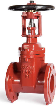
FG970-ER 2" - 24"