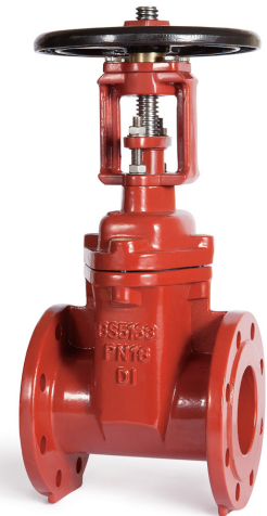
FG975-ER 2" - 16"