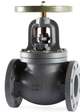
GL970-R 2" - 12"