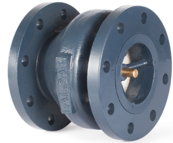
CF975-V 2" - 16"

Globe Style Center-Oriented, Spring Actuated Flange Dimension EN1092-2, ANSI B16.1