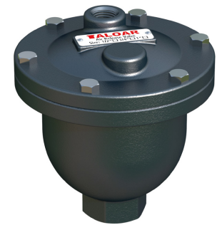
VT-690 1/2" - 1"