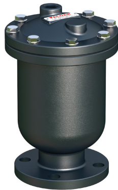
VT-660 2" - 4"