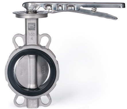
HB350-L/G/O 2" - 12"

Wafer Style Design to EN953 and MSS SP-67 Flange Dimension to EN1092-2, ANSI B16.1 Class 125